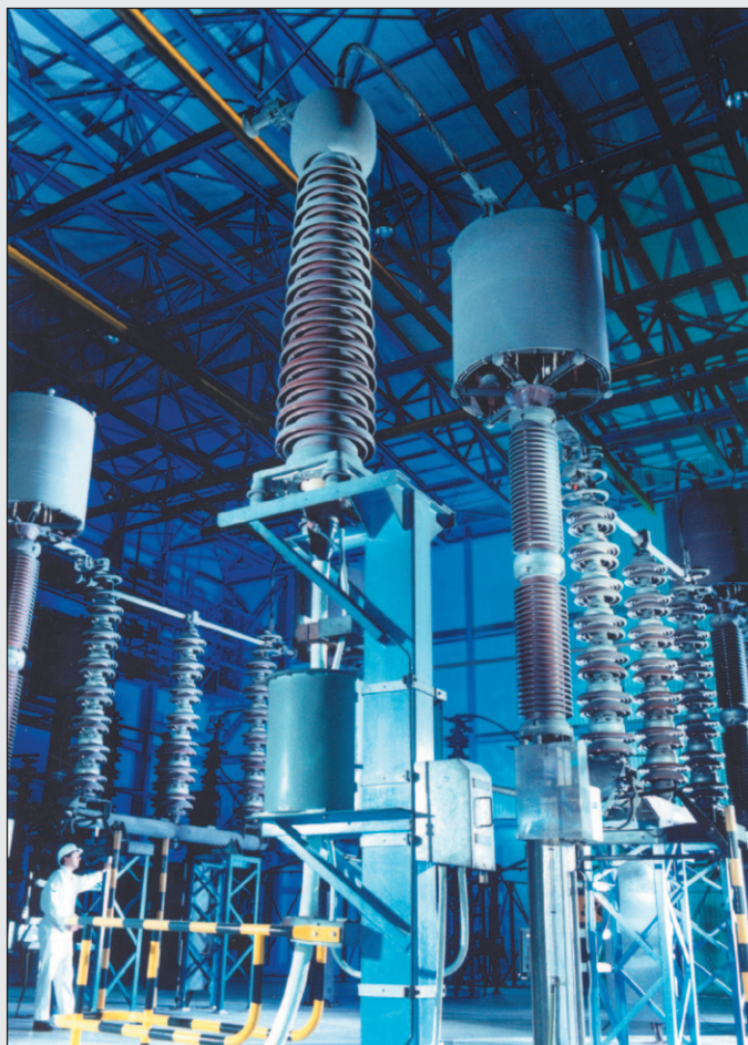
Power station (Peterhead CS)

Cermet II can provide the solution to both energy management and quality assurance in the supply of pure gases and compressed air from heat regenerative, adsorption dryers. The durability of the Advanced Ceramic Moisture Sensor provides long term service in applications such as pipeline drying using vacuum and dry gas purging techniques.