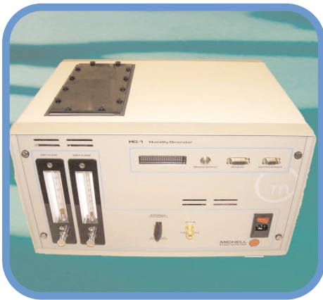
HG-1 Humidity Calibrator

A low-cost, easy to use and fully integrated system for the calibration of dew-point and relative humidity sensors from 2 to 90 % relative humidity, -30 to +20 °C dew point