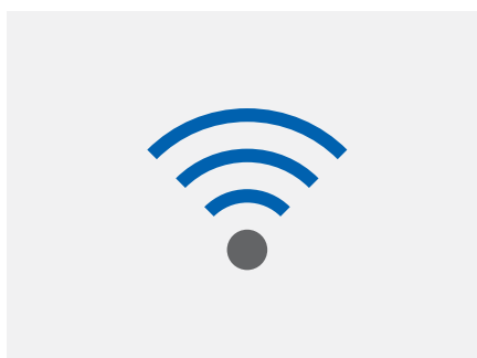
NEW: Wireless data transfer via WiFi