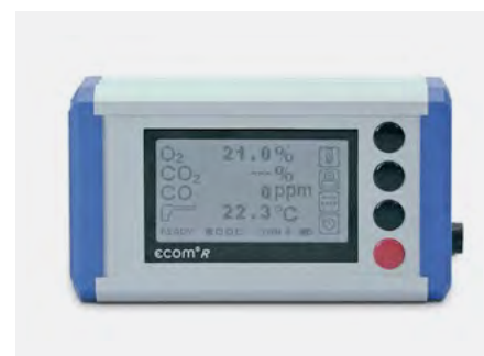
NEW: ecom-R remote monitor with data storing / printing capabilities by distance