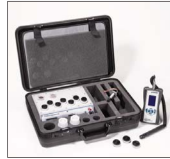
S503 calibration set