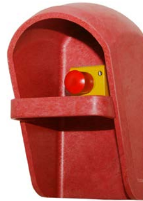
Example of an application (the switch is not included in the supply)