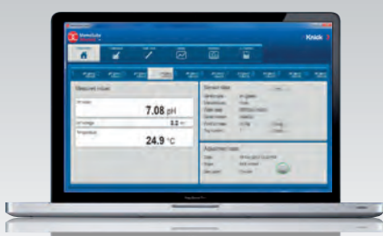
MemoSuite Software tool for calibration, sensor diagnostics and database documentation