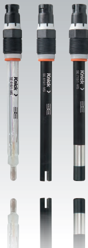
Memosens Sensors pH, Cond, Oxy, Temp