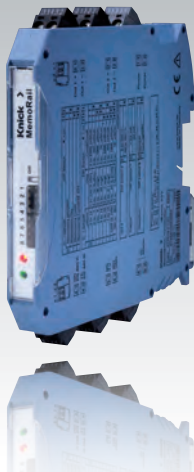
MemoRail Digital analyzer for Memosens sensors